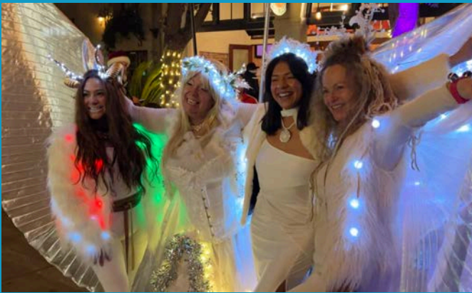
Let it Glow Lighted Costume Party