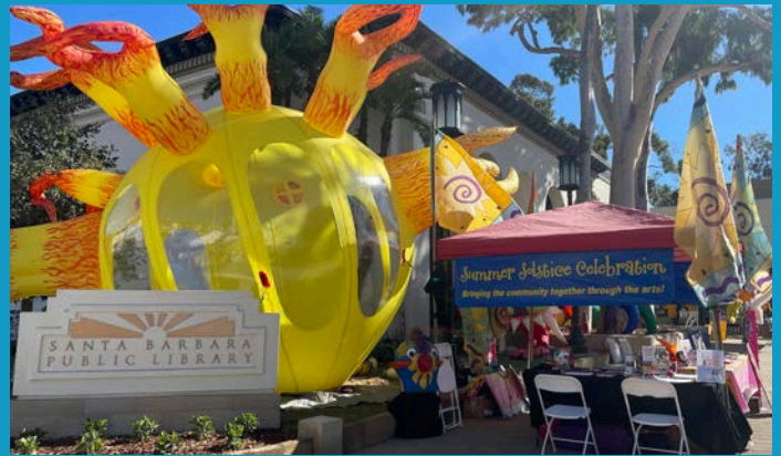
Towbes Plaza Opening Reception