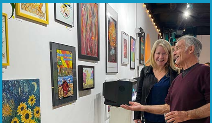
Wyld Works Poster Art Reception