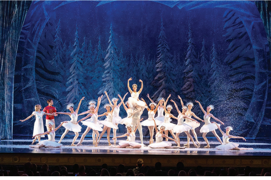
A snow-filled spectacular performance of The Nutcracker by State Street Ballet