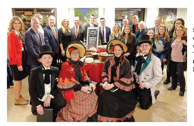
Some Christmas celebration guests surrounding the "Charles Dickens Carolers"